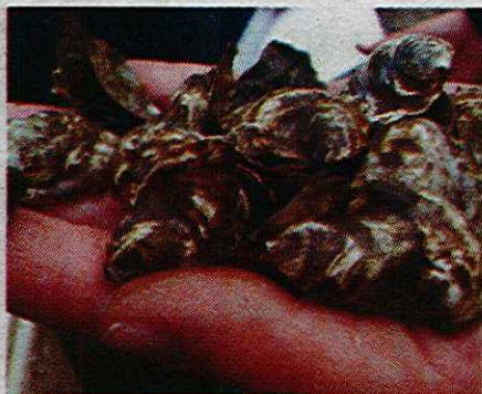
Learn about the Hudson River's oyster gardens tomorrow (April 10) in Yonkers.

Oyster gardening in Yonkers. Find out what is